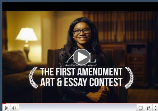
ADL's First Amendment Art & Essay Contest

Share the entry form and video below with your partners, networks, and youth!