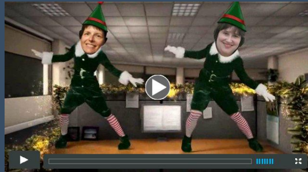
Happy Holidays from SCY 2013

We hope you and your loved ones have a very happy and safe holiday. Please enjoy this short video from SCY and then "Elf Yourself" at http://www.elfyourself.com/ .