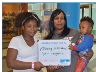
"I strengthen Chicago's youth by...providing afterschool youth programs" -Lurie Children's family