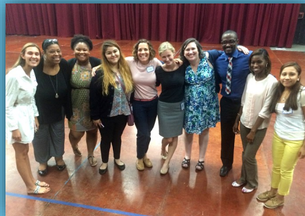
Community-Academic Collaboration research team, including community partners and youth scribes from Chicago high schools

Partners attended two Violence Data Landscape educational seminars