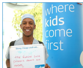
"Strong Chicago youth are... the future Lurie Children's doctors and nurses." -Lurie Children's clinician