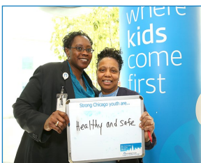
"Strong Chicago youth are...healthy and safe." -Lurie Children's staff

National Youth Violence Prevention Week is an annual observance focused on raising awareness and providing education about the impact of violence in schools and communities and how youth, families, schools, and communities can get involved to prevent violence. In 2016, SCY led a social media campaign to increase awareness about actions that individuals can take to prevent violence and strengthen Chicago's youth.